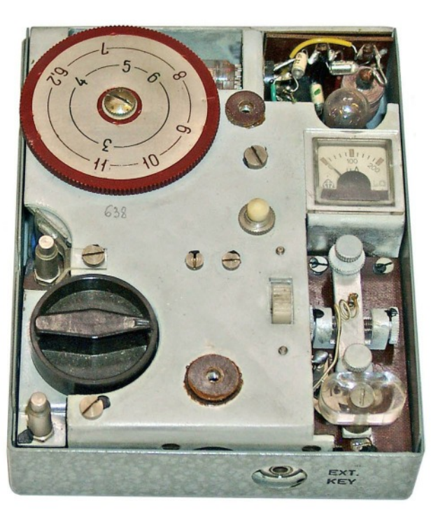
Internal view of Neptun transmitter with top cover removed. Note the miniature hand-speed Morse key in the right hand bottom corner.