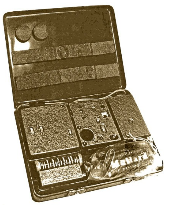
Complete Neptun transmitter with accessories (note the Mullard spare valve wrapped in plastic) packed in a transit case.